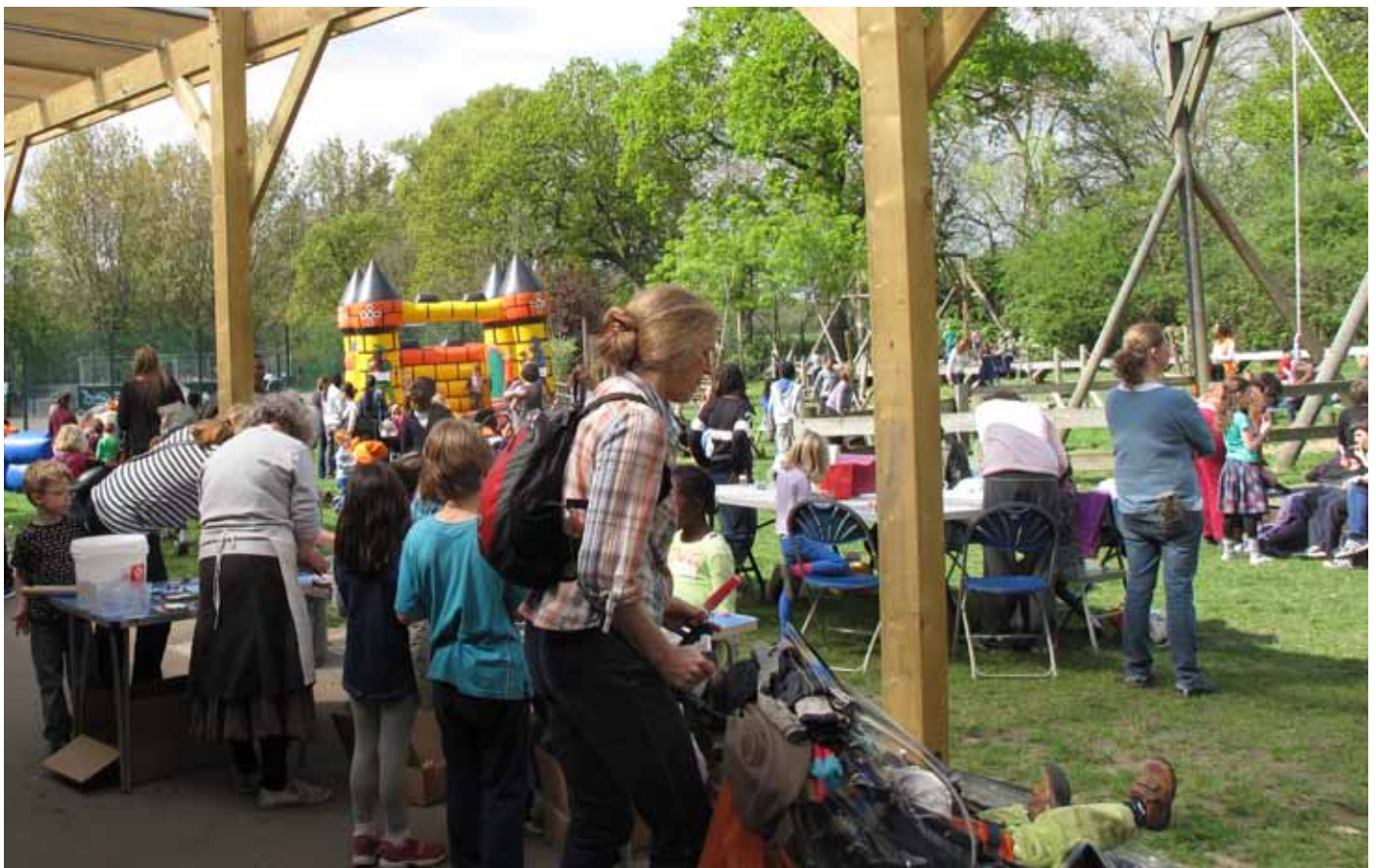
Fun Day at the Adventure Playground, Friday April 11th 2014

The adventure playground is currently open for children aged five to eighteen during term time on Tuesdays to Fridays after school from 3.30pm to 6.30pm and on Saturdays from 10 to 4pm. During holidays it is open during week days from 11am to 5pm, but closed on Saturdays. On Sundays there is a two-hour session for children with special needs.