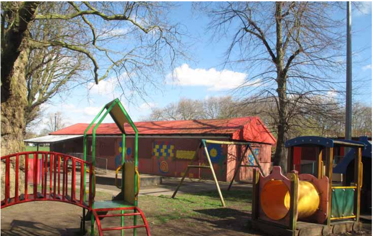
Play equipment outside the former One O'Clock Club, currently known as Peckham Playroom

The main area of concern expressed was about the close proximity of the playground to the café, which they felt would make the café very noisy and would deter people without children. They added that they would like to see natural play items, rather than brightly coloured off the shelf climbing frames and suggested some kind of structure for parents to shelter. They argued for a fence around the children's play area – to keep dogs out and children away from bikes.