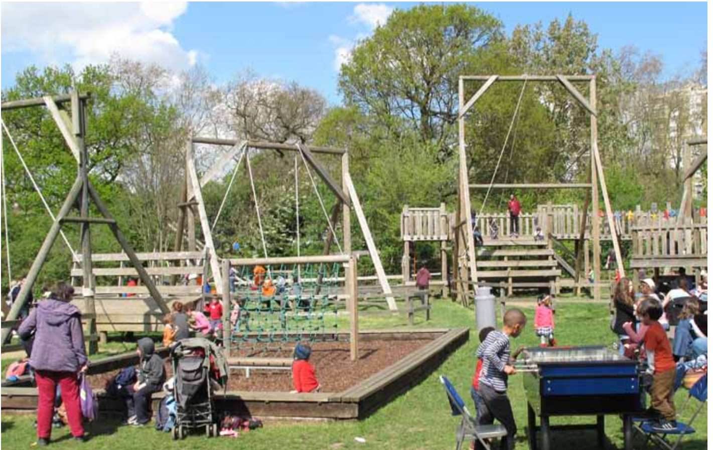
Adventure Playground Fun Day, April 11th 2014