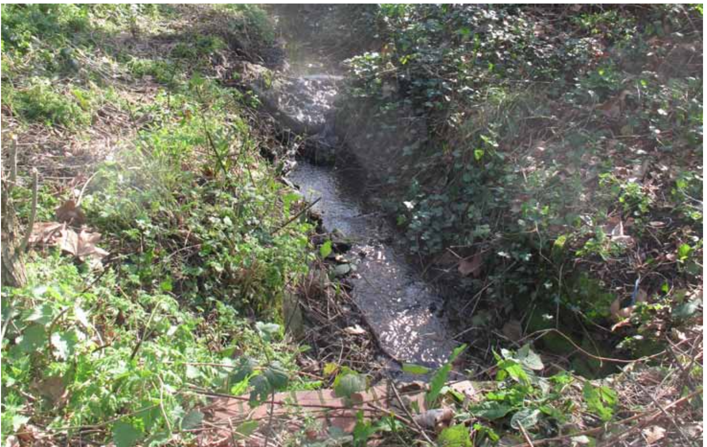
The stream was identified as an opportunity: could it be developed into more of a feature in its own right?