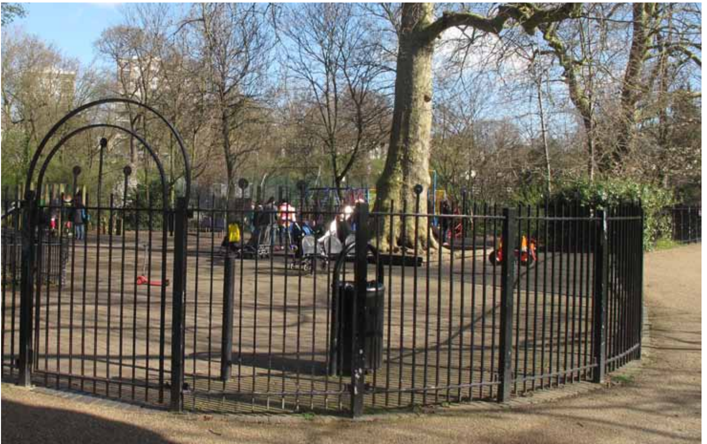
The current gated play area

The majority of people liked the proposal for a new larger play area on the site of the current playroom and football changing rooms and were positive about the idea of a play space next to the café. Some however argued that current location suited them better and worried that a play area near to the café would result in children asking for treats, others argued for two play spaces, one in each location.