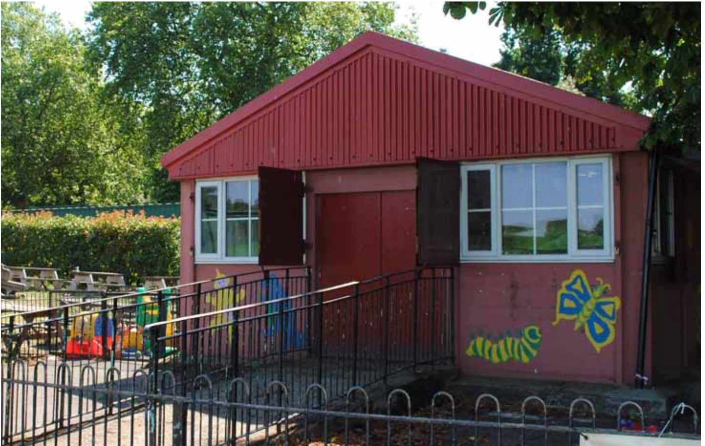
The current Peckham Playroom building