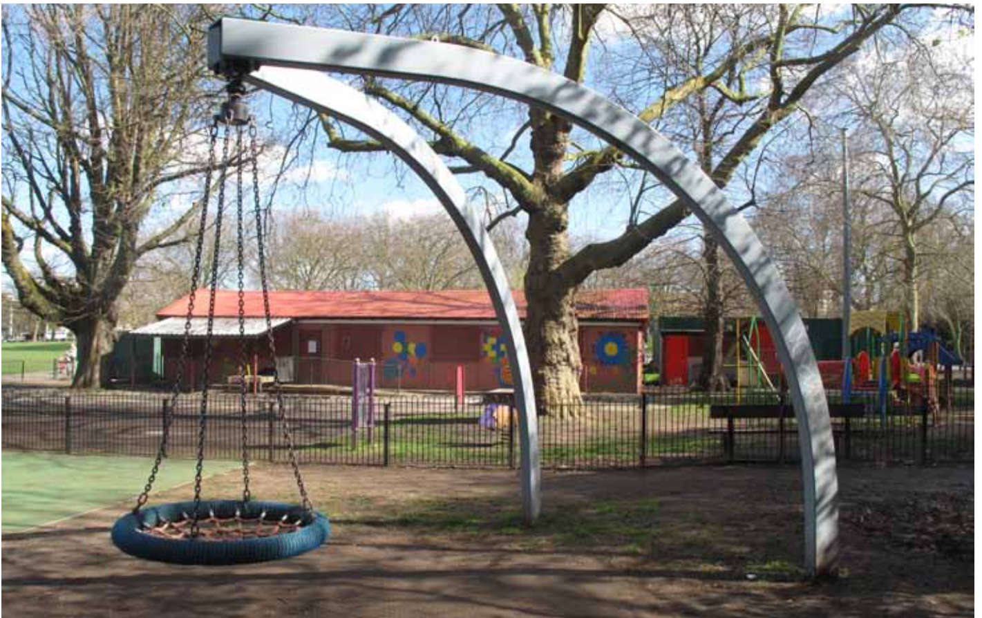
Swing outside of gated Peckham Playroom play area: the ground is quite waterlogged here