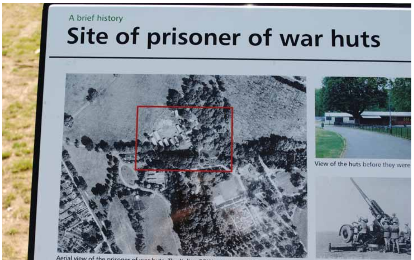
Interpretation board telling the story of the Prisoner of War Huts, Peckham Rye Park